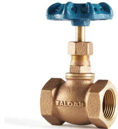
G107 1/2" - 3"